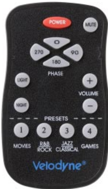
Figure 2. Remote Display

Figure 2 shows the remote control, enabling you to easily choose whatever listening mode you desire.